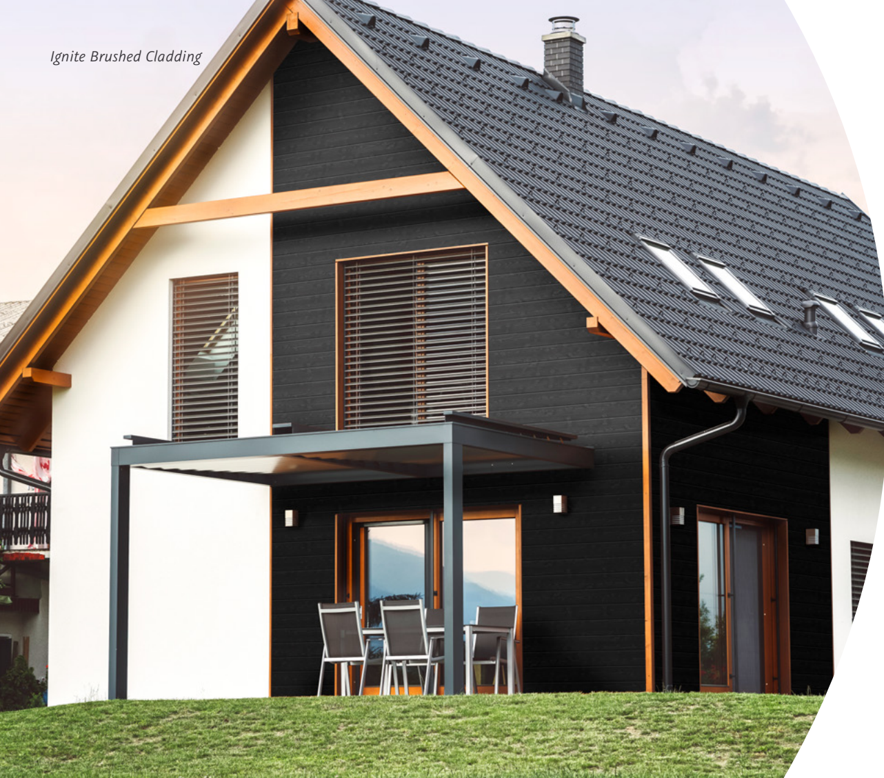
Ignite Brushed Cladding

IGNITE by THERMORY mimics the traditional look of shou sugi ban with the added benefits of thermal modification.