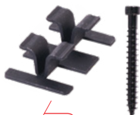
T4 (4") T6 (6")