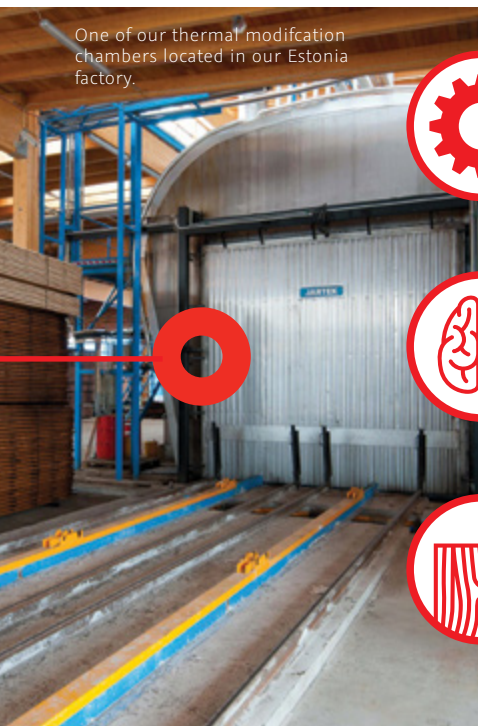
One of our thermal modification chambers located in our Estonia factory.