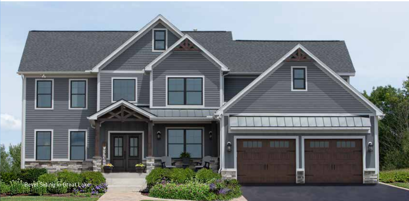
Bevel Siding in Great Lake