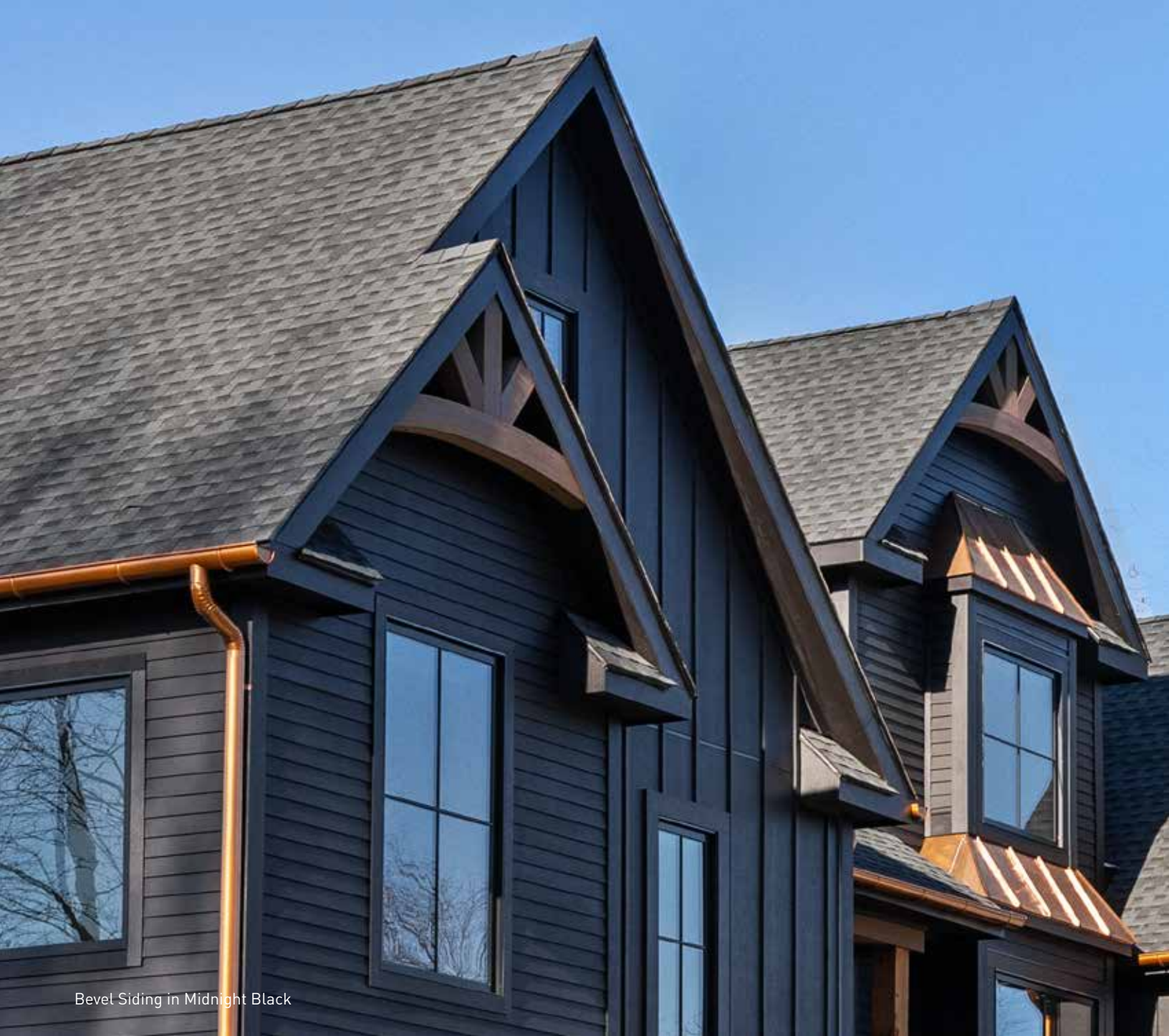
Bevel Siding in Midnight Black