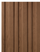
Coppered Oak MCBF360C