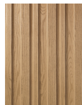
Golden Oak MCBF360G