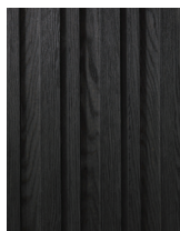
Burnt Cedar MCBF360R