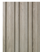
Smoked Oak MCBF360D