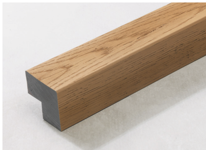
Envello Square Corner Trim

Width: 2" (50mm) Thickness: 2" (50mm) Length: 120" (3050mm) Weight: 20lb (9.1kg) Construction: Flexible polymer system