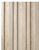
Limed Oak MCBF360L