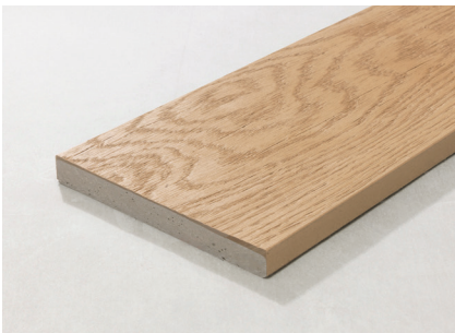
Envello Reveal Board

Anthracite: MCPTF50X Antique Oak: MCPTF50A Burnt Cedar: MCPTF50R Coppered Oak: MCPTF50C Golden Oak: MCPTF50G Jarrah: MCPTF50J Limed Oak: MCPTF50L Smoked Oak: MCPTF50D