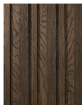
Antique Oak MCBF360A