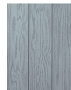
Salt Blue: MCL360T