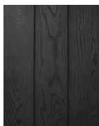
Burnt Cedar: MCL360R