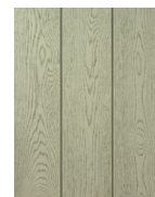
Sage Green: MCL360N