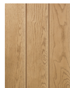
Golden Oak: MCL360G