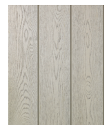
Smoked Oak: MCL360D