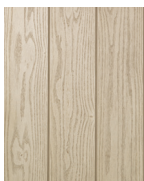
Lined Oak: MCL360L