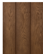
Coppered Oak: MCL360C